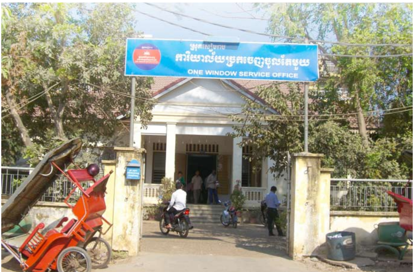
Towards decentralisation and deconcentration, the One Window Service Office aims to bring all public services closer to local people, Battambang province Dec 2013

The team has prepared some of these papers for international publication, three as journal articles and one as a chapter for an edited book. Within CDRI, the unit contributed two papers for the Annual Development Review 2013-14 : "The Effect of D&D Reforms on Local Democracy from a Political Geographer's Perspective: A Case Study of the Tonle Sap Demarcation Project" and "Interrelationship between District and Commune Councils: Representation and Accountability in Local Governance". The unit also published three articles in the Cambodia Development