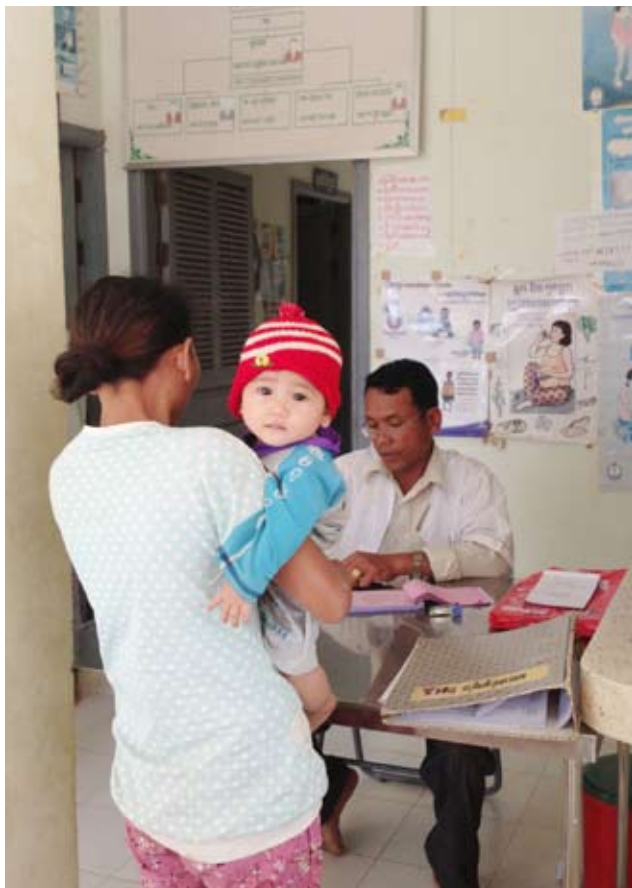
Research on obstetric referral in the public health system seeks to understand the positive delivery journeys of women in Cambodia, Dec 2014

Diffusing research into practice is fundamental to our work. A consultation workshop on the theme “Child Labour in Cambodia” that brought together researchers, development partners and experts, and representatives of government and international agencies stimulated a lively debate and new ideas on a better framework to regulate child labour with a focus on the best interests of the child. As part of its collaborative research undertakings, the unit has produced a chapter titled “Securing Secondary Education” for CDRI’s annual flagship publication— Cambodia Education 2015: Employment and Empowerment .