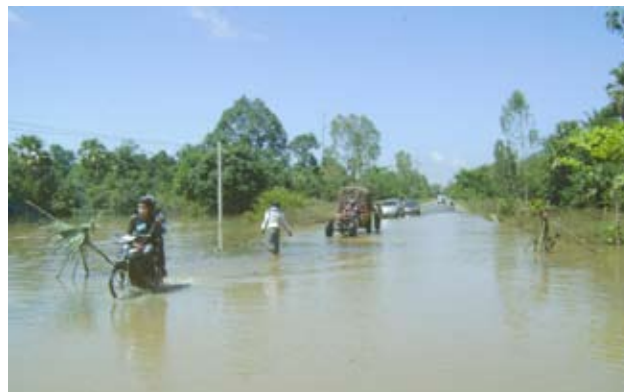
The most direct effects of climate change such as irregular rainfall, drought and flooding are already having far-reaching consequences for the lives and livelihoods of local people, Kompong Thom province Aug 2011

An important aspect of our work is to deliver research knowledge through engagement directly with stakeholders at all levels. This year we organised a Policy Engagement Dissemination Workshop for 300