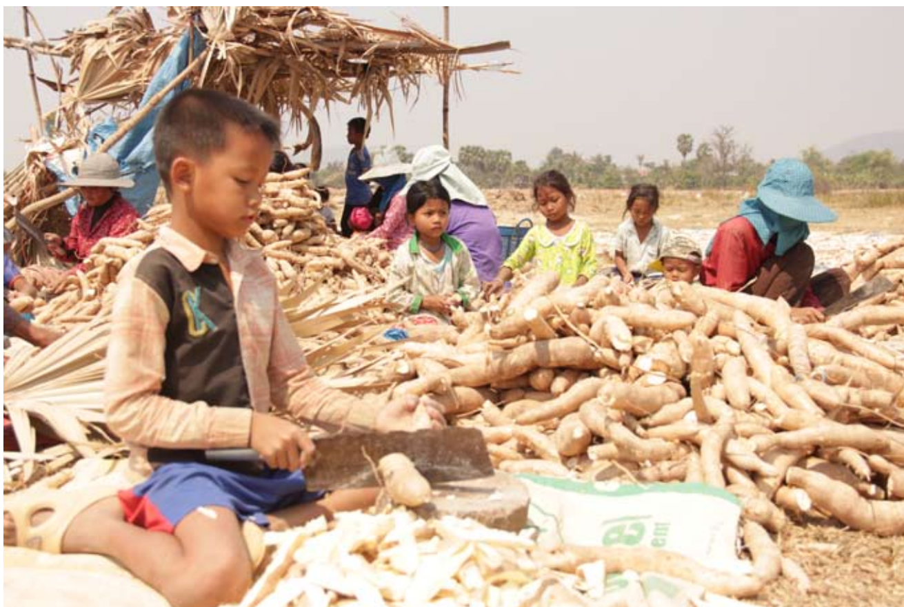
CDRI’s collaborative work on diverse issues to do with child labour has stimulated new ideas for a better regulatory framework and contributed to a number of related policies, Siem Reap province May 2013

Our work for 2015 has a strong start with the development of five new projects: Opinion Leader Research (OLR) on Infant and Young Child Feeding (IYCF) ; a social marketing approach to Roles of non-State Providers in Reproductive Health and Family Planning ; a Verification of Sanitation Outcomes to assess the impact of improved rural sanitation; the Influence of Adolescent Norms on Students’ Performance in Basic Education ; and, from a gender perspective, Career Pathways for Health Workers in Cambodia .