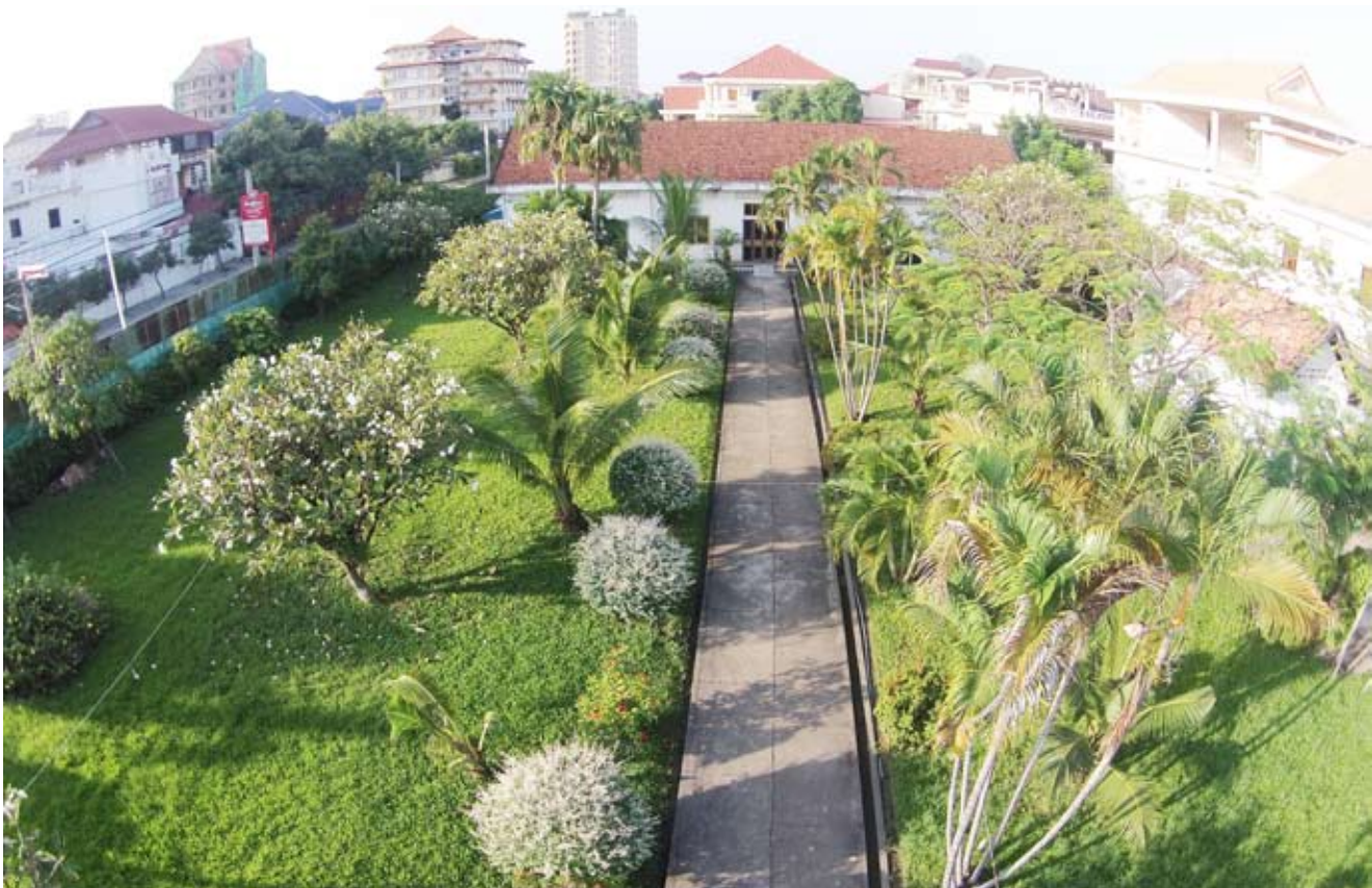
វប្បធម៌ កោះបៃតង ក្នុងទីក្រុង ខែមករា ឆ្នាំ២០១៤ CDRI: An urban green island, Jan 2014