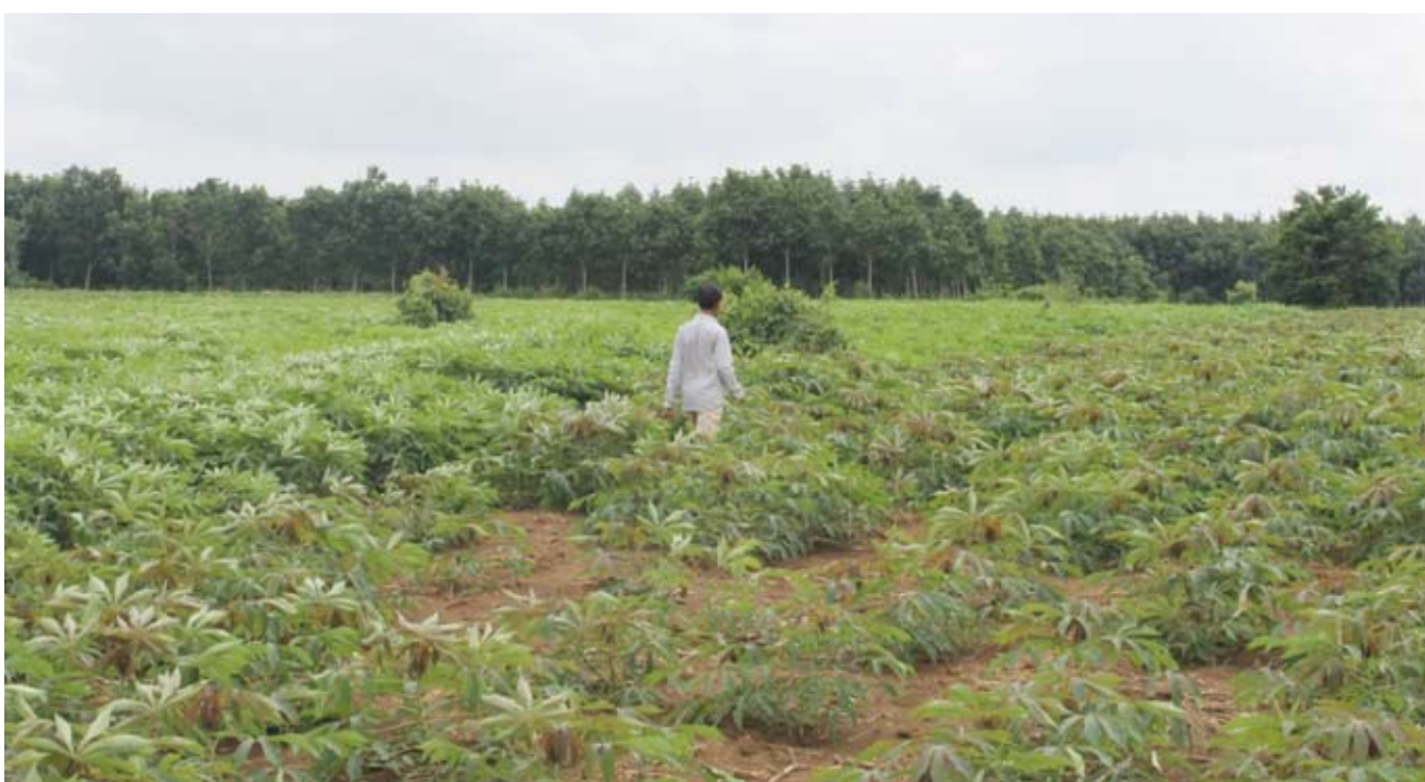
After rice and rubber, cassava and soybeans have possible production and export potential: A cassava plantation in Pailin province, May 2014

The team has also joined with other research units to work on the ReBUILD project; a study on Labour Migration in Cambodia: Causes and Impacts on Poverty, Inequality and Productivity ; an Endline Study on the Contribution of Arbitration Council Foundation (ACF) Services in Improving Industrial Relations in Cambodia ; and a Follow Up Study on the 2011 Nationwide Knowledge, Attitude and Practice Study on Climate Change in Cambodia (KAP2) .