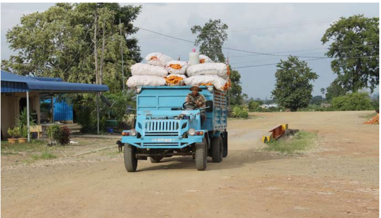
Improving food security through research is one of our key activities at CDRI: Truck loaded with maize for processing, Pailin province May 2014

Regular publications include the monthly Flash Report on the Cambodian Economy , “Economy Watch” in the quarterly Cambodia Development Review , quarterly Vulnerable Worker Surveys , and monthly Provincial Price Surveys .