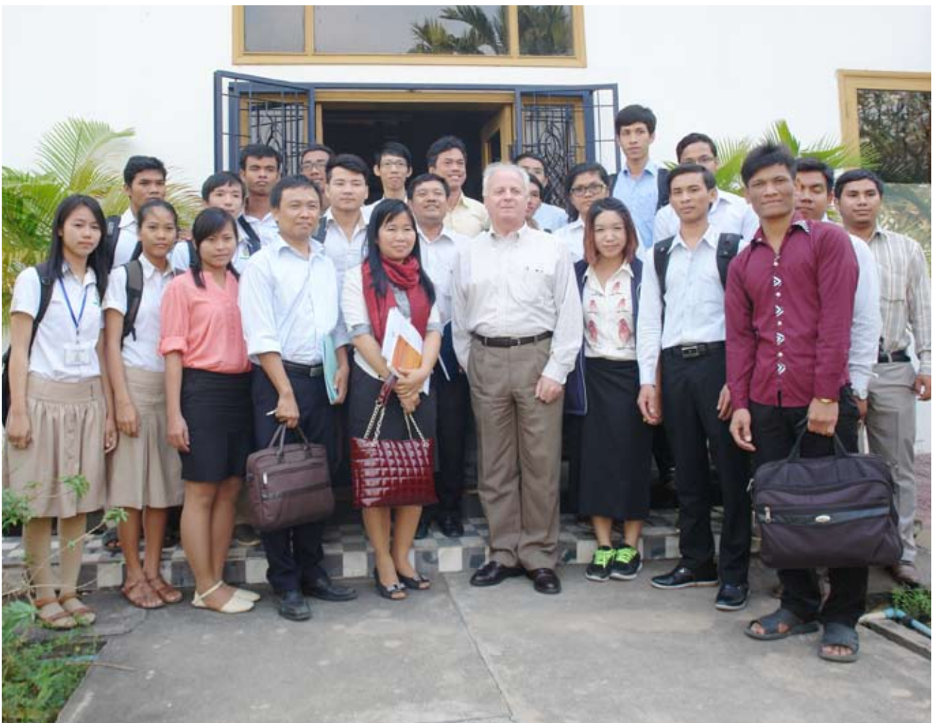
Fulfilling our vision through capacity development: Students visit CDRI, sponsored by an IDRC-funded water management project, Jan 2014

The library allows digital access to its extensive collection of some 19,000 items via its online catalogue, made available for public access through NewGenLib. Many of these titles can be downloaded in PDF format. The library also holds online journals and databases including AGRO, OARE (Online Access to Research in the Environment), HINARI (Health Inter-network Access to Research Initiative), JSTOR, BioOne, CORPUS and the International Monetary Fund e-library, all of which can be accessed through the CDRI website. Up to 200 visitors use the library every month.