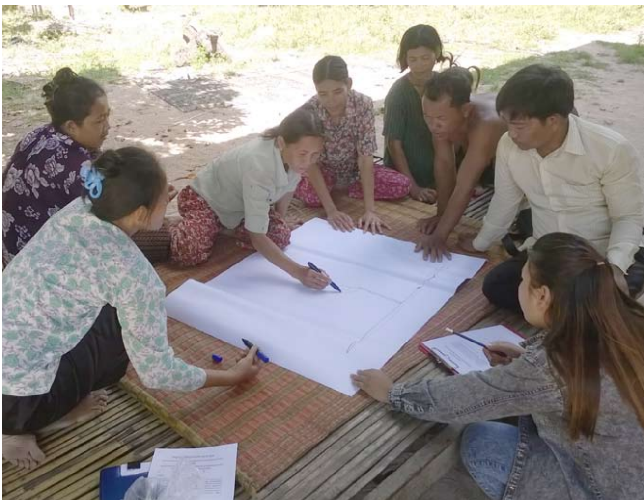
People’s participation is increasingly central to CDRI’s research: We encourage local people to understand and experience the thrill of acquiring new knowledge and skills, Kompong Thom Aug 2014