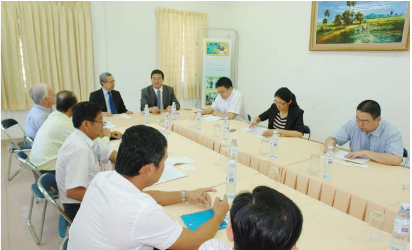
Senior CDRI researchers and representatives from the National Institute of International Strategy, Chinese Academy of Social Sciences (CASS), meet to reflect on the most important problems and possible policy responses for Cambodia, Dec 2014

gap, the team has been engaged in a joint work on technical and vocational education and training in Cambodia. This study will be published as a chapter titled “Shaping and Scaling Up TVET” in Cambodia Education 2015: Employment and Empowerment .