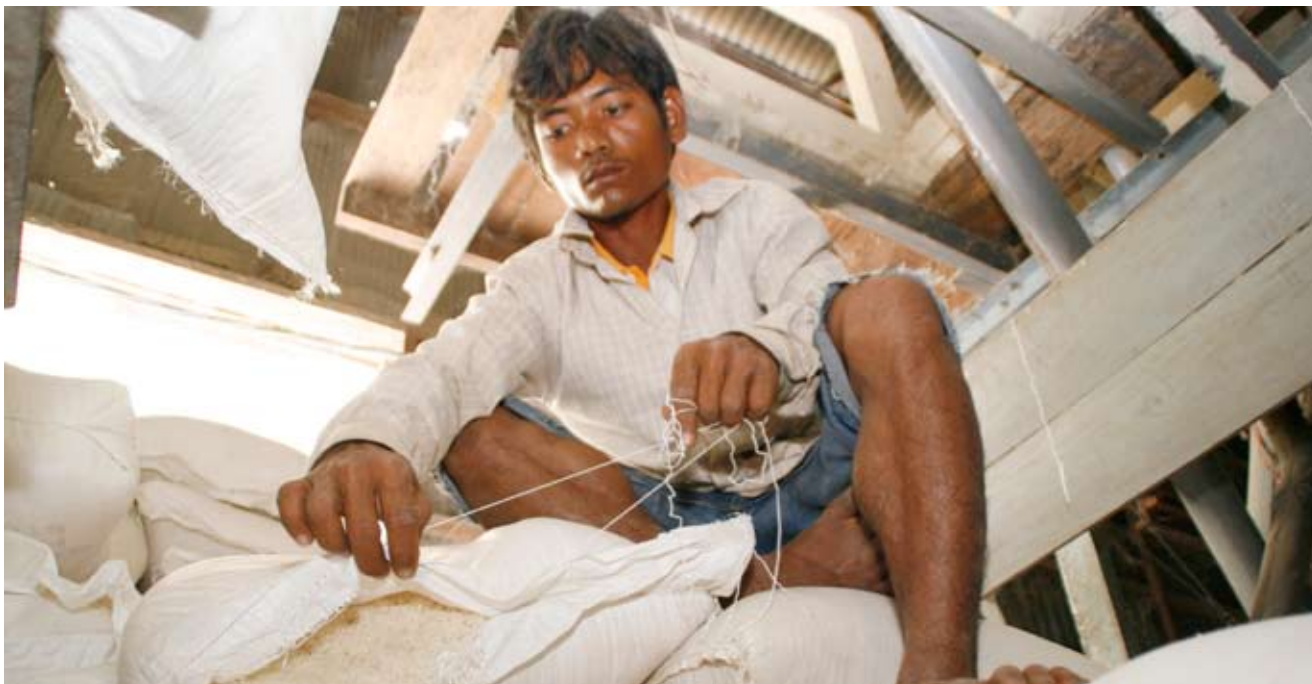
CDRI's research on the 'Impact of Rice Export Promotion Policy on Well-being' highlighted the need for smallholder-sensitive strategies, Kandal province Apr 2014

the Impact of Rice Export Promotion Policy on Well-being , and the other, in assessing the Impact of Contract Farming on Smallholder Livelihoods , identifies different contract farming models, associated policy and legal frameworks and the need for smallholder-sensitive support strategies. Data has been collected and the first draft report prepared for the Study on Farm Mechanisation and Agricultural Labour Market Trends to explore the relationship between off-farm employment and investing in machinery. These last three projects receive support from Sida. The unit has just been awarded a four-year research study (2015-18) on Testing Innovative Models of Extension