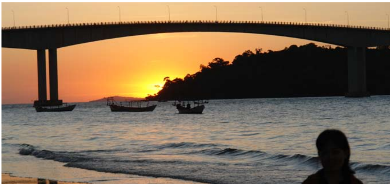
'We heal the earth, we heal ourselves': Environmental ethics requires us to consider the effects of actions on a natural world that we often take for granted, Sihanoukville Dec 2014