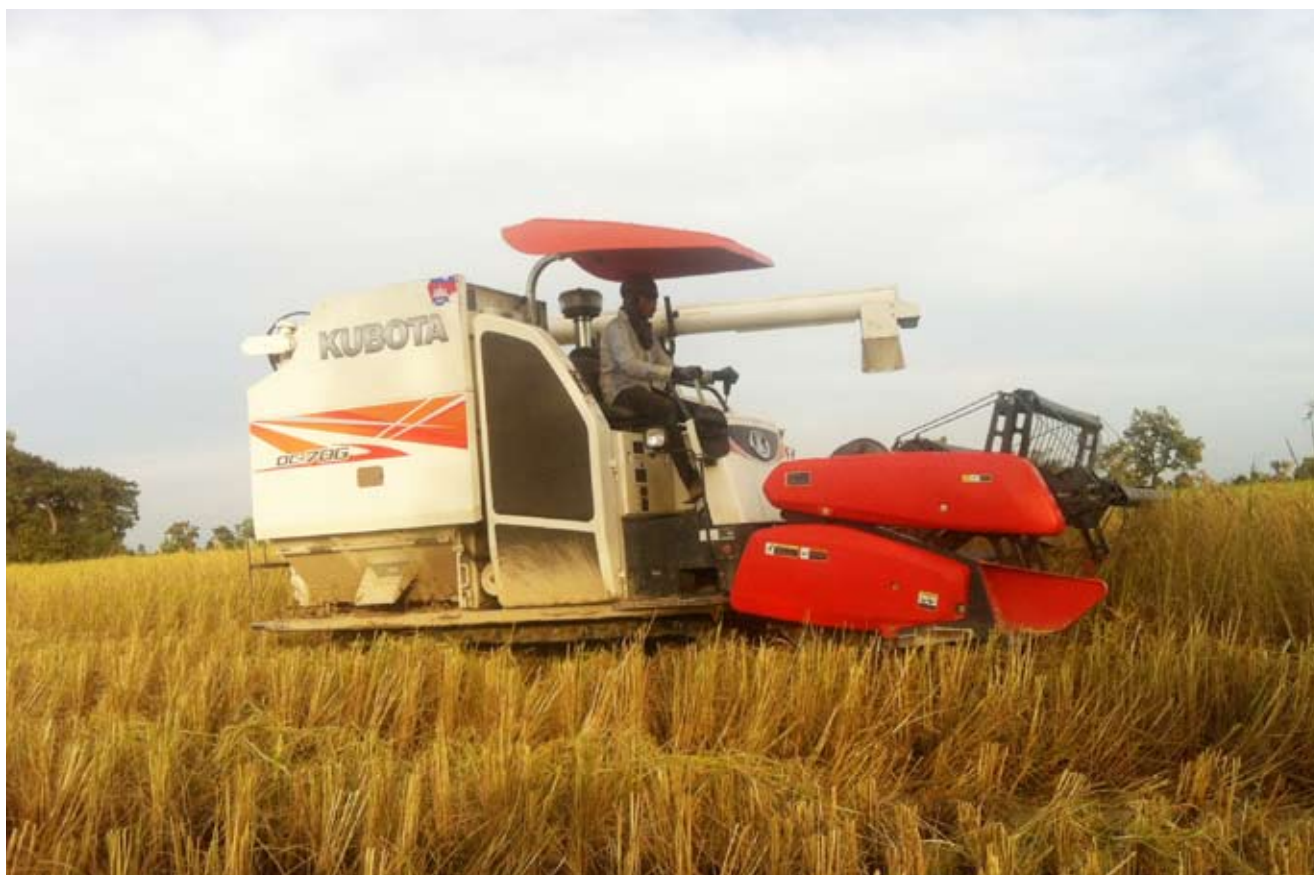
Commitment to agricultural development is reflected in improvements in modern rice production technology, Pursat province Nov 2014