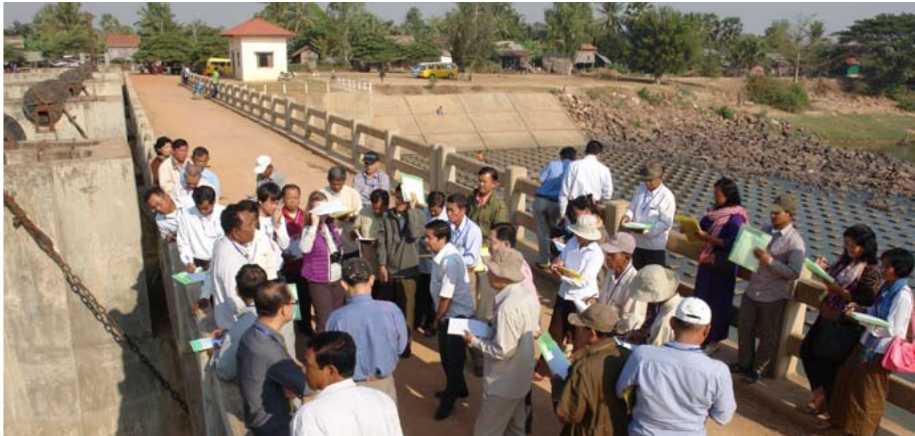
ការចែករំលែកដោយផ្ទាល់នូវចំណេះដឹងស្រាវជ្រាវ ក្នុងសិក្ខាសាលាថ្នាក់ខេត្ត ស្តីពី ការប្រែប្រួលអាកាសធាតុ និងអភិបាលកិច្ចទឹក រៀបចំដោយ ក្រុមការងារបរិស្ថាន នៅខេត្តពោធិ៍សាត់ ខែមករា ឆ្នាំ២០១៥ 'Hands on' sharing of research knowledge at a provincial workshop on climate change and water governance organised by the Environment team, Pursat province, Jan 2015

ភាពជាដៃគូរវាង CDRI-Sida៖ ការបូកសរុបពាក់ កណ្តាលអាណត្តិពី ភាពជាដៃគូផ្តល់ធនធានឆ្នាំ២០១១-១៥ រវាង CDRI និងទីភ្នាក់ងារអភិវឌ្ឍន៍អន្តរជាតិនៃប្រទេស ស៊ុយអែត (Sida) បានធ្វើឡើងក្នុងខែកុម្ភៈ ២០១៤។ ការ បូកសរុបនេះ ដែលអនុវត្តឡើងដោយទីប្រឹក្សាឯករាជ្យមួយ ក្រុម រួមមានទាំងការពិភាក្សាយ៉ាងលម្អិតជាមួយបុគ្គលិក និង គណៈគ្រប់គ្រង CDRI និងការពិគ្រោះយោបល់ជាមួយដៃគូ និងអ្នកពាក់ព័ន្ធជាមួយ CDRI ចំនួន ២៥ស្ថាប័ន។ លទ្ធផល ចម្បងៗនៃការបូកសរុប មានលក្ខណៈវិជ្ជមានជាខ្លាំង ហើយ បញ្ជាក់ពីតួនាទី និងការងាររបស់ CDRI ព្រមទាំងប្រសិទ្ធភាព នៃជំនួយទ្រទ្រង់ហិរញ្ញវត្ថុរបស់ Sida។ របាយការណ៍បូក សរុប មានលក្ខណៈវិជ្ជមាន ជាពិសេសលើការយល់ឃើញ ពីសំណាក់អ្នកខាងក្រៅ អំពីផលប្រយោជន៍ និងការងារ របស់ CDRI នៅក្នុងបរិយាកាសនយោបាយកម្ពុជាសព្វថ្ងៃ ហើយចំណុចសំខាន់មួយទៀត គឺការយល់ឃើញជាទូទៅ ក្នុងចំណោមអ្នកពាក់ព័ន្ធចម្បងៗថា CDRI មានជោគជ័យ ក្នុងការរក្សាបាននូវតុល្យភាពល្អរវាងការចូលពាក់ព័ន្ធ និង ភាពឯករាជ្យ នៅក្នុងបរិយាកាសនយោបាយពោរពេញដោយ បញ្ហាប្រឈម។ លទ្ធផលនៃការបូកសរុបពាក់កណ្តាល អាណត្តិនេះ បានលើកយកមកពិភាក្សា ហើយមានការយល់ ស្របតាមដោយមានការកែសម្រួលបន្តិចបន្តួច នៅក្នុងកិច្ច ប្រជុំបូកសរុបប្រចាំឆ្នាំរបស់ CDRI-Sida កាលពីខែឧសភា។