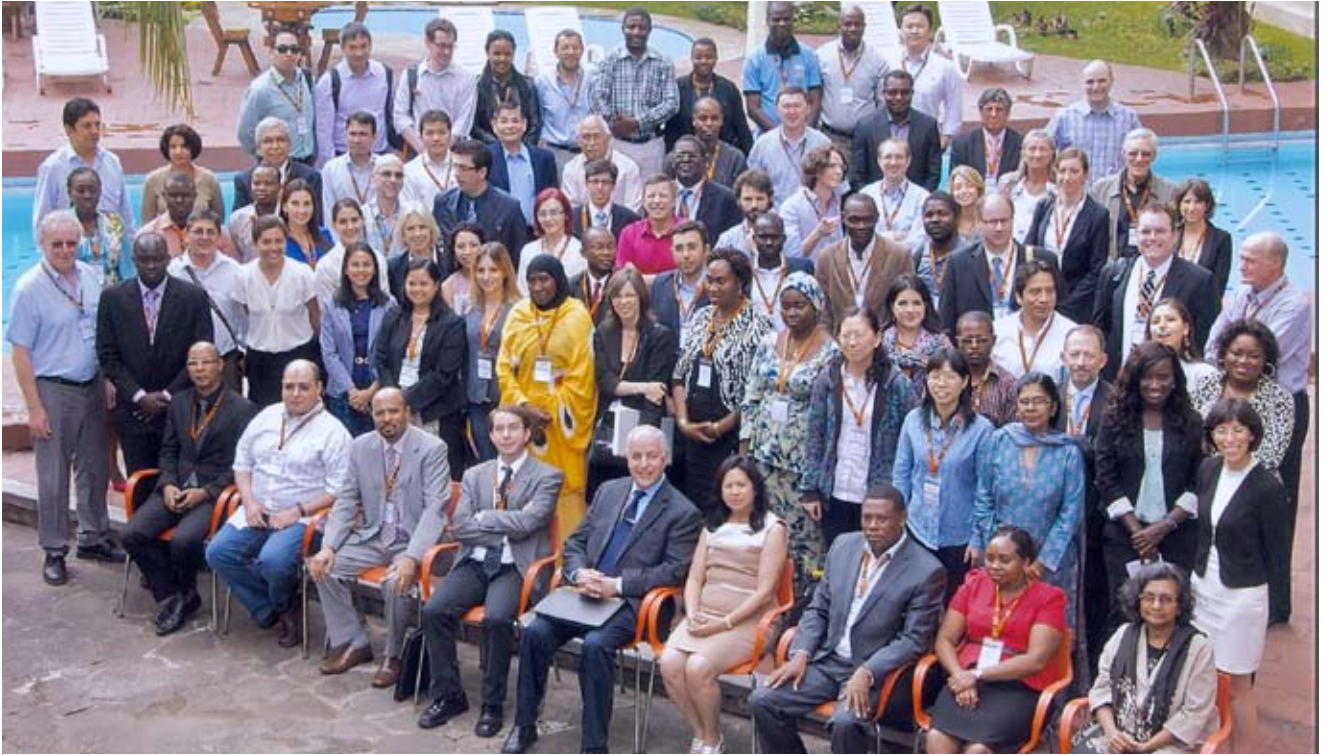
អ្នកស្រាវជ្រាវនៃវិទ្យាស្ថាន CDRI តំណាងឲ្យ CDRI នៅឯសន្និសីទ ភាពជាដៃគូសម្រាប់គោលនយោបាយសេដ្ឋកិច្ច, ប្រទេសបូលីវី ខែឧសភា ឆ្នាំ២០១៤ A CDRI researcher represented CDRI at the Partnership for Economic Policy (PEP) Conference in Bolivia, May 2014

ការរៀបចំប្រមូលធនធាន៖ ដើម្បីឆ្លើយតបនឹង អនុសាសន៍ចម្បងមួយ ក្នុងការបូកសរុបពាក់កណ្តាល អាណត្តិរបស់ Sida នោះ CDRI បានធ្វើបញ្ជីបណ្តោះអាសន្ន មួយកំណត់ពី បណ្តាញ និងដៃគូចម្បងៗ និងជាសក្តានុពល របស់វិទ្យាស្ថាន។ បញ្ជីនេះ គឺជាជំហានដំបូង ក្នុងការកំណត់ នូវអាទិភាព និងគោលដៅថ្មីៗ និងមានស្រាប់ ដើម្បីកសាង យុទ្ធសាស្ត្ររៀបចំប្រមូលធនធាន "ពិតប្រាកដ" មួយ ដោយ ប្រើប្រាស់សមត្ថភាពជំនាញទាំងនៅខាងក្នុង និងនៅខាង ក្រៅវិទ្យាស្ថាន។