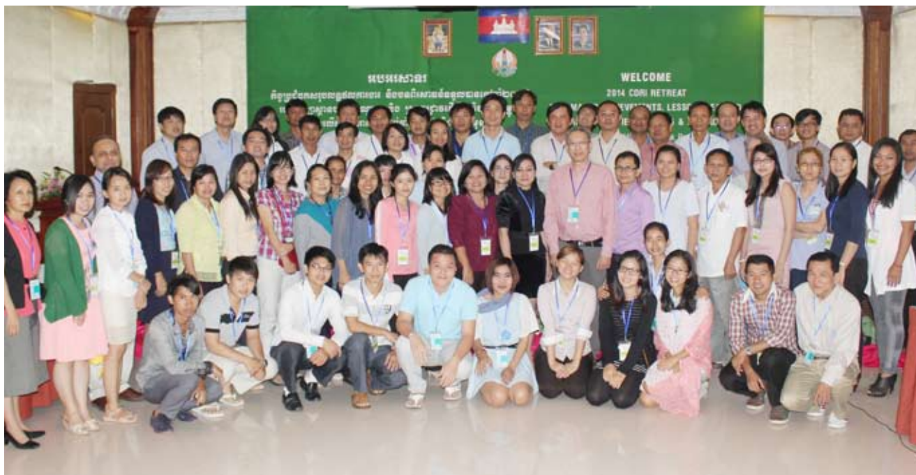
បុគ្គលិក វិទ្យាស្ថាន វបសអ នៅក្រុងព្រះសីហនុ ខែធ្នូ ឆ្នាំ២០១៤ CDRI staff, Sihanoukville Dec 2014