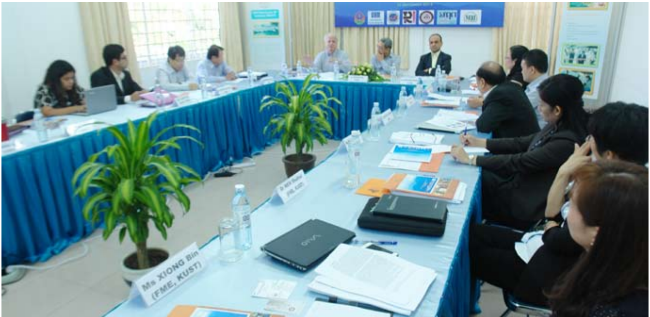
ក្នុងឋានៈជាអ្នកសម្របសម្រួល បណ្តាញវិភាគអភិវឌ្ឍន៍មហាអន្តរក្រសួង វិទ្យាស្ថាន CDRI បានរៀបចំកិច្ចប្រជុំធ្វើផែនការ សម្រាប់ក្រុមស្រាវជ្រាវមកពីប្រទេសដៃគូនានា ខែឧសភា ឆ្នាំ២០១៤ As coordinator of the Greater Mekong Subregion Development Analysis Network (GMS-DAN), CDRI hosts a planning meeting for the multi-country research team, Sep 2014

ការបញ្ចូលបញ្ហាយេនឌ័រទៅក្នុងការស្រាវជ្រាវ: ស្របតាម ការប្តេជ្ញាចិត្តដូចមានបញ្ជាក់ក្នុង យុទ្ធសាស្ត្រស្រាវជ្រាវ ប្រទេសកម្ពុជាឆ្នាំ២០២០ របស់ CDRI ក្នុងការបញ្ជ្រាបបញ្ហា យេនឌ័រសំខាន់ៗ ទៅក្នុងការស្រាវជ្រាវរបស់វិទ្យាស្ថាននោះ CDRI បាននិងកំពុងចូលរួមក្នុង កម្មវិធីចម្លើយតបដោយ មានការសម្របសម្រួលរបស់សហគមន៍ ទៅនឹងអំពើ ហិង្សាលើស្ត្រី។ គោលដៅសំខាន់មួយក្នុងកម្មវិធីនេះ គឺការ បង្កើតបណ្តាញមួយសម្រាប់ជួយទ្រទ្រង់ដល់ បុគ្គល និង គ្រួសាររងឥទ្ធិពលពីអំពើហិង្សាក្នុងគ្រួសារ។ កម្មវិធីនេះក៏មាន