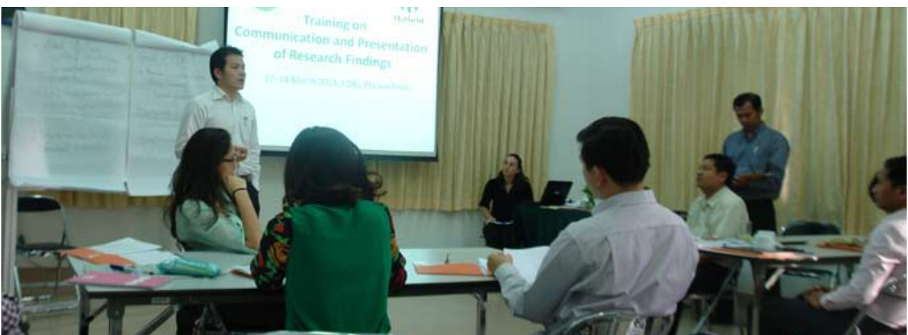
Researchers attend in-house training on Communicating Research, Mar 2014

Research capacity building: CDRI integrates capacity building in its research programme work to develop and strengthen individual and group capacities, institutional arrangements and professional human resources in Cambodia. In 2014, CDRI researchers received in-house training on advanced research methods and research communication. Many researchers also attended external training courses and workshops aimed at learning new knowledge and research skills including research writing and analytical techniques. This capacity building was organised under the ReBUILD project, the GMS-DAN and the DRF. CDRI also provided training on climate change and water management to local officials in the Tonle Sap area. Sixteen CDRI researchers are pursuing master's and doctorate studies at universities in Australia, Canada, Japan, New Zealand, Thailand and the United States.