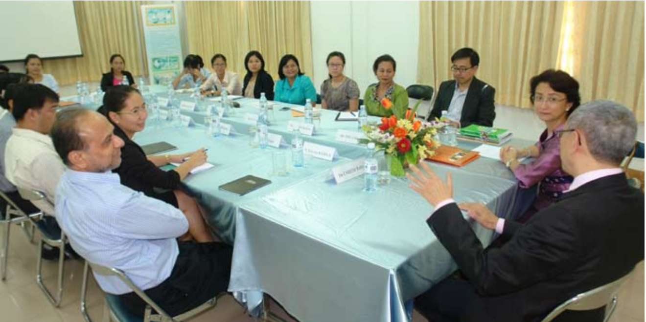
At a roundtable with the Minister of Women's Affairs, researchers gained insights into the politics of gender equality and empowerment and the dynamic nature of gender affairs, Nov 2014