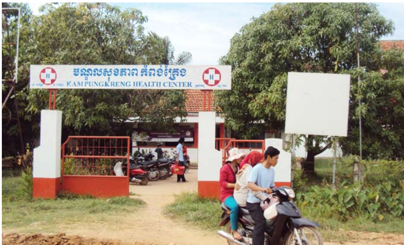
Research produced by the Health Unit aims to improve health-related quality of life through informed policy and practice that ensures all people have access to basic healthcare, Kampot province Dec 2013