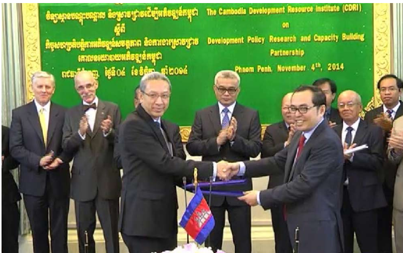
Signing ceremony of a first memorandum of understanding between CDRI and the Ministry of Economy and Finance, Phnom Penh Nov 2014

CDRI-Sida partnership: A mid-term review (MTR) of the 2011-15 resource partnership between CDRI and the Swedish International Development Agency (Sida) was held in February 2014. The review, conducted by independent consultants, involved intensive discussions with CDRI management and staff and consultations with 25 CDRI partners and stakeholders. The major findings were very positive and affirming of CDRI’s role and work, and the value for money of Sida’s financial support. The report was particularly positive in relation to the perceived value of CDRI and its work in the Cambodian policy environment, but also importantly the widespread perception among key stakeholders that CDRI has managed to achieve a careful balance between engagement and independence in a challenging political environment. The outcomes of the MTR were discussed and endorsed with some suggested fine-tuning at CDRI-Sida’s annual review meeting in May.