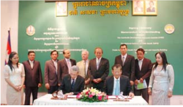
CDRI and the National Institute of Public Health sign a memorandum of understanding to establish a collaborative research partnership, Jan 2015

of Public Health, Royal University of Agriculture, Royal University of Phnom Penh and the Supreme National Economic Council. The partnership successfully organised the seventh annual DRF Symposium, for young and emerging Cambodian researchers, on the theme Cambodia Tomorrow: Development Research Priorities for a Middle Income Country , held in Phnom Penh in September. An internal review affirmed that the partnership is achieving its goals and objectives in building a professional research network and bridging research communities. Training on research methodologies, data analysis, project management and presentation skills has enhanced young researchers' technical and communication capacities. Capacity building is augmented by knowledge sharing via interactions on the DRF online platform between established researchers and academics, policymakers, young researchers and students.