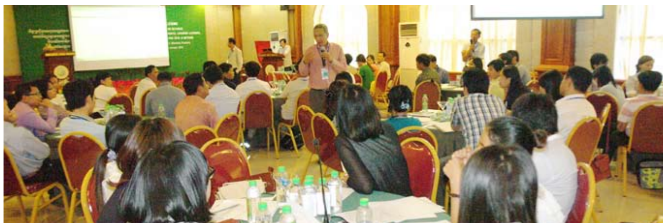
Researchers 'walk the talk' for research excellence at the annual staff retreat, Sihanoukville Dec 2014