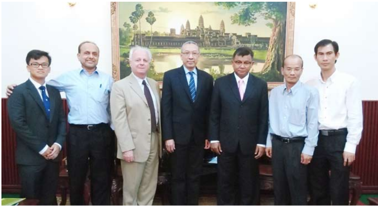
A senior CDRI management team pays a courtesy visit to the Minister of Education, Phnom Penh Dec 2014

local adaptive capacities to climate change and for improving Cambodia’s overall water governance.