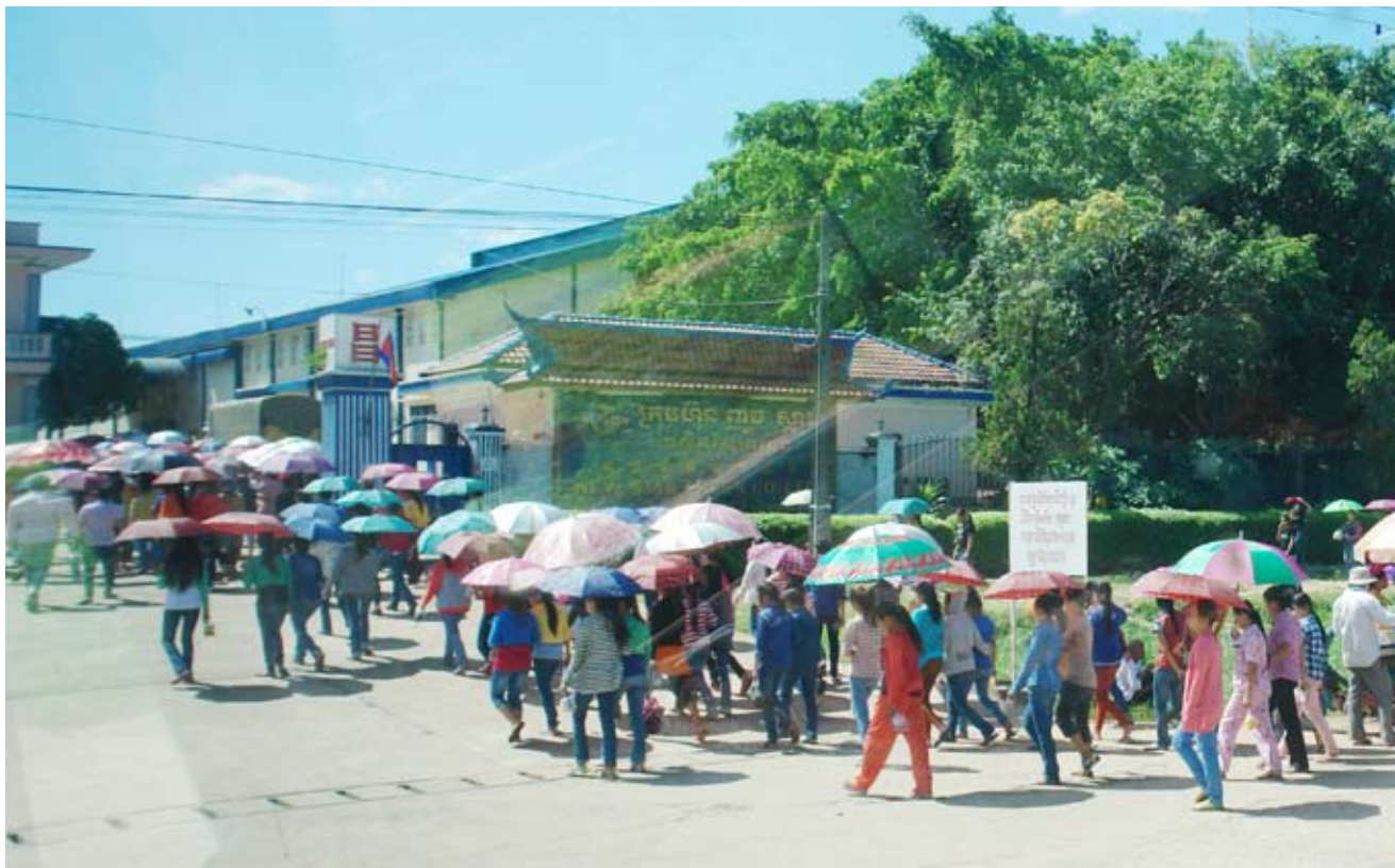
Women workers in the export-oriented garment industry contribute substantially to the economic welfare of their families and to Cambodia's foreign exchange earnings, Sihanoukville Dec 2014